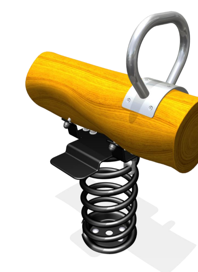
3. Veerwip Stier